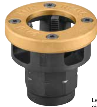
Left-hand pipe thread