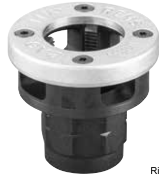
Right-hand pipe thread