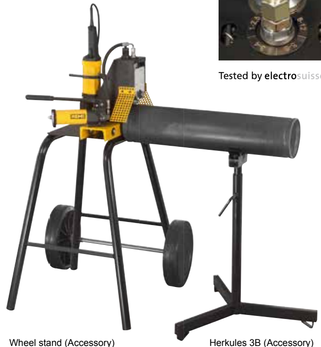
Wheel stand (Accessory)