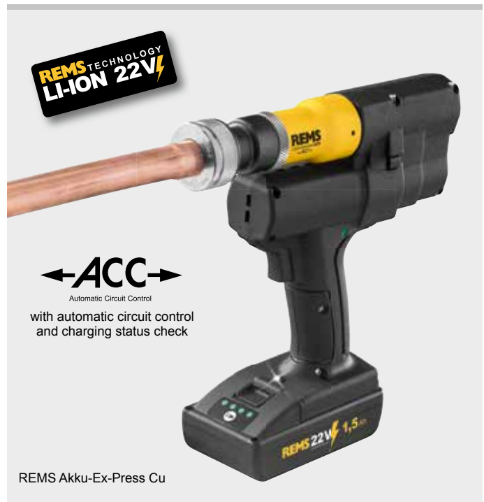
REMS Akku-Ex-Press Cu

High expanding force for perfect, split-second expanding. Thrust force 20 kN. Powerful electro-hydraulic drive with automatic return (ACC), with powerful battery motor 21.6V, 380W output, robust planetary gear, eccentric reciprocating pump and compact high power hydraulic system. Safety switch.