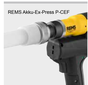
REMS Akku-Ex-Press P-CEF