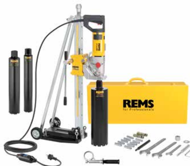
REMS Picus S3 Set 62-82-132 Titan