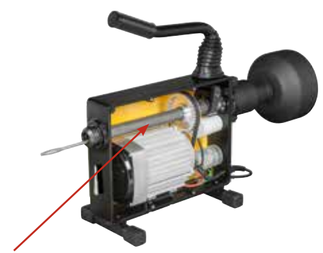
Straight through closed drive spindle protects motor and drive against dirt and water.