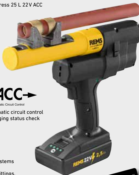
REMS Ax-Press 25 L 22V ACC