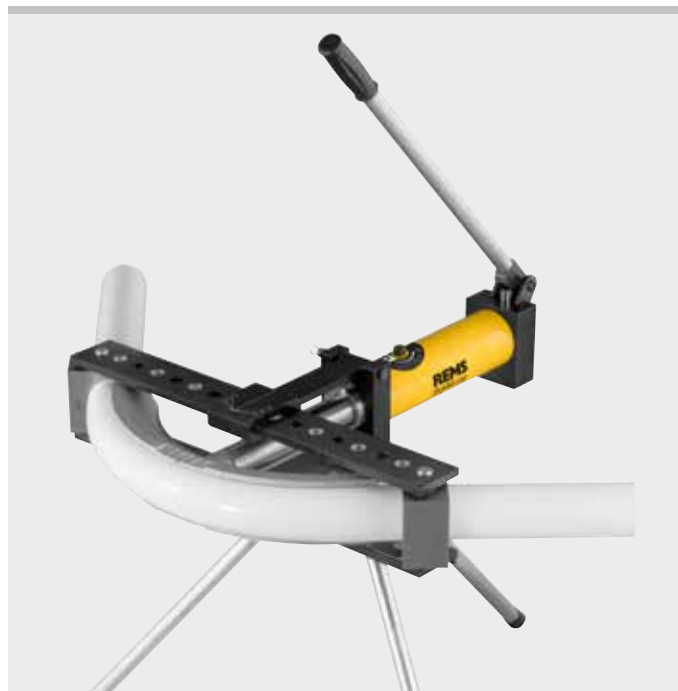
German Quality Product

Oil-hydraulic drive unit with hydraulic cylinder made from high-quality, rolled hydraulic tube. Overload protection of the hydraulic thrust in the foremost piston position and overpressure valves for safe working. Ergonomically designed thrust lever for strength saving pressure build-up with manual hydraulic pump. No danger of crushing due to end limiting of the thrust lever, for high work safety.