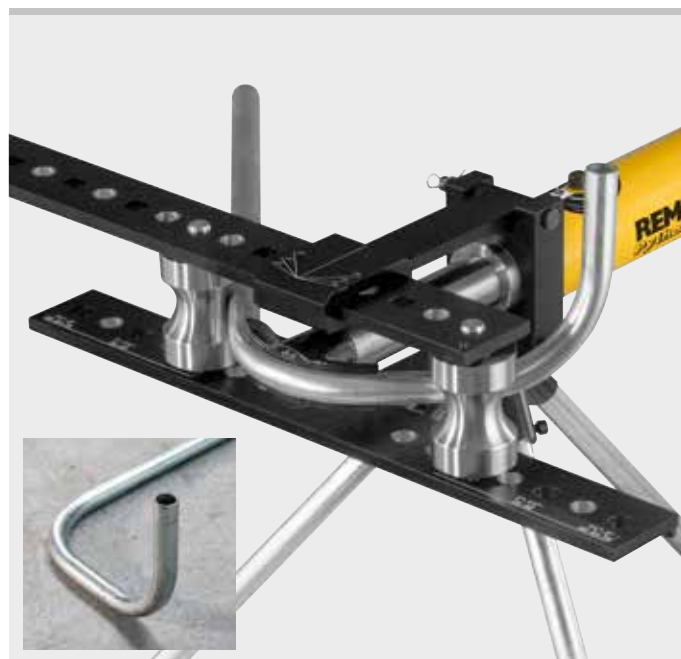
Doglegs on several levels.