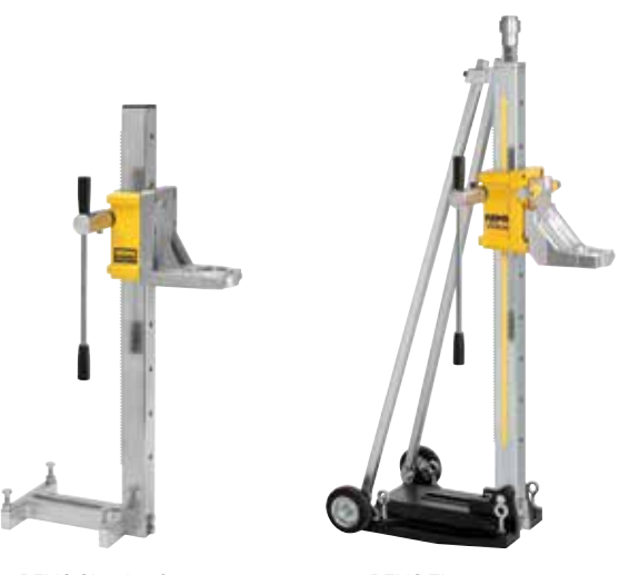
REMS Simplex 2