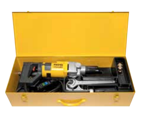
REMS Picus S1 Basic-Pack