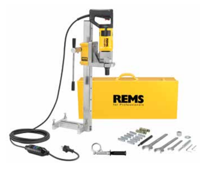
REMS Picus S1 Set Simplex 2