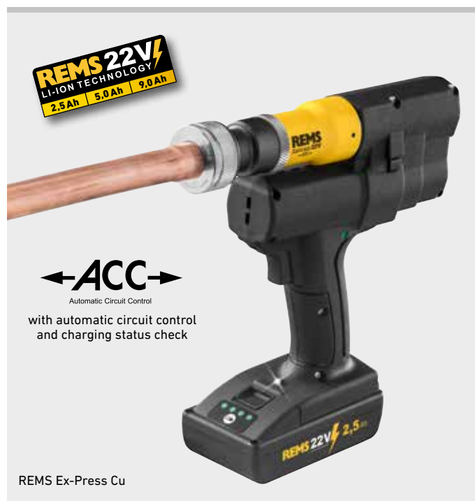
REMS Ex-Press Cu

High expanding force for perfect, split-second expanding. Thrust force 20 kN. Powerful electro-hydraulic drive with automatic return (ACC), with powerful battery motor 22 V, 380 W output, robust planetary gear, eccentric reciprocating pump and compact high power hydraulic system. Safety switch.