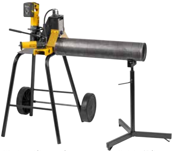
Wheel stand (Accessory)