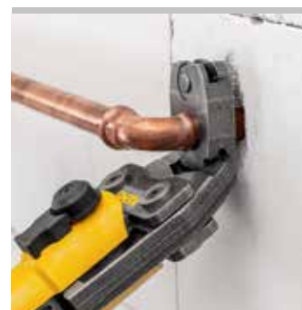
REMS pressing ring S (PR-2B), continuously swivellable