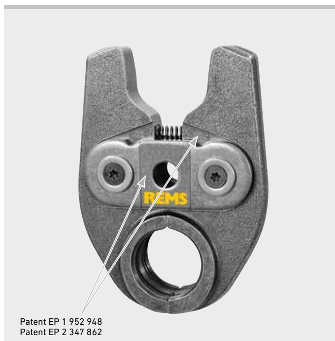
German Quality Product

With this traceability REMS fulfils the recommendations of the European standard EN 1775:2007 for the installation of pressfitting systems for gas.