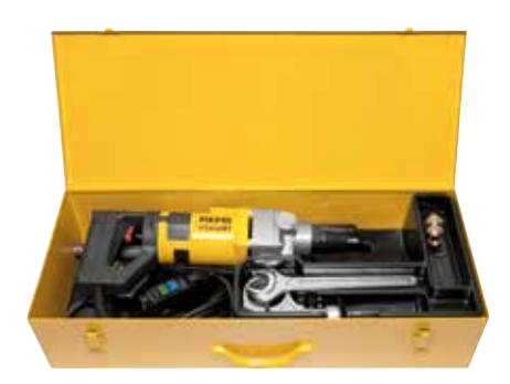
REMS Picus S1 Basic-Pack