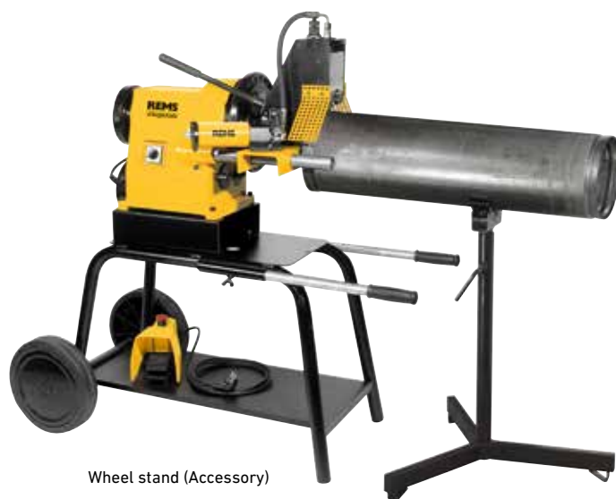
Wheel stand (Accessory)