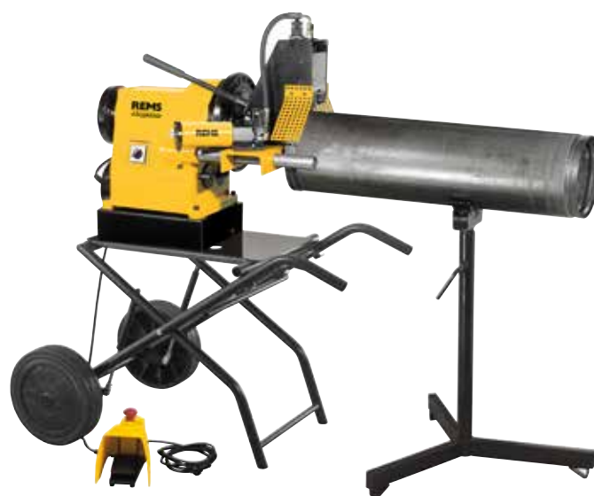
Collapsible wheel stand (Accessory)