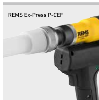
REMS Ex-Press P-CEF