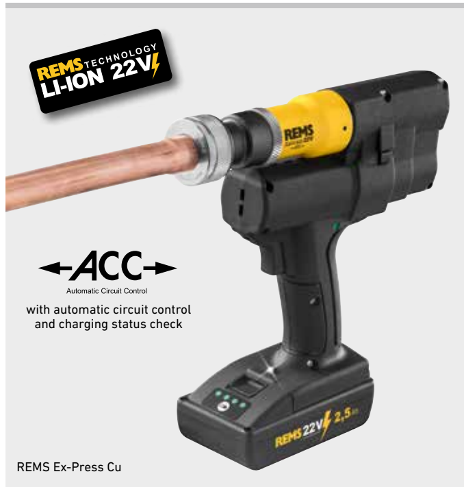
REMS Ex-Press Cu

High expanding force for perfect, split-second expanding. Thrust force 20 kN. Powerful electro-hydraulic drive with automatic return (ACC), with powerful battery motor 21.6 V, 380 W output, robust planetary gear, eccentric reciprocating pump and compact high power hydraulic system. Safety switch.