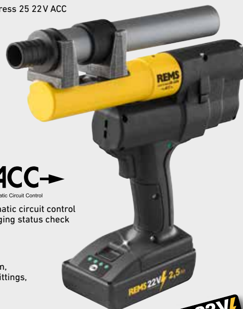
REMS Ax-Press 25 22V ACC

Various pipe expanders and complete range of REMS expanding heads for all common pressure sleeve systems