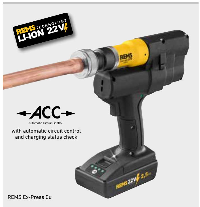
REMS Ex-Press Cu

High expanding force for perfect, split-second expanding. Thrust force 20 kN. Powerful electro-hydraulic drive with automatic return (ACC), with powerful battery motor 21.6V, 380W output, robust planetary gear, eccentric reciprocating pump and compact high power hydraulic system. Safety switch.