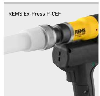
REMS Ex-Press P-CEF