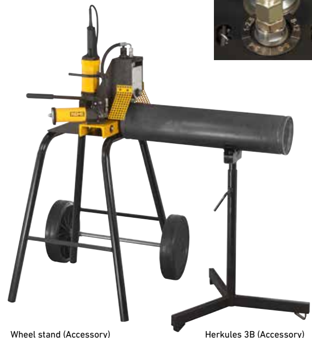
Wheel stand (Accessory)