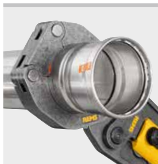
REMS pressing rings (PR-3B)