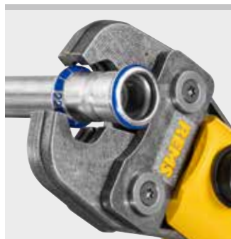
REMS pressing tongs (PZ-2B)