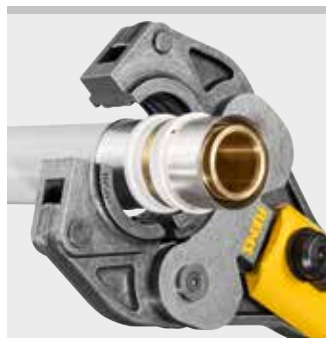
REMS pressing tongs (PZ-S)