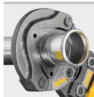
REMS pressing rings (PR-3S)