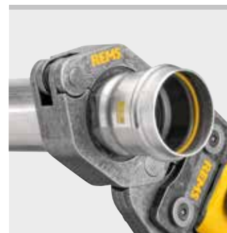
REMS pressing rings (PR-2B)