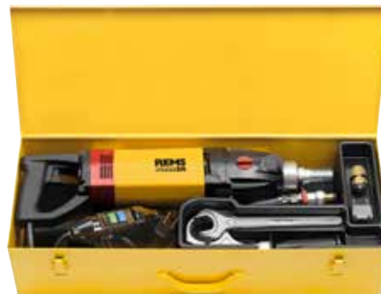
REMS Picus SR Basic-Pack

Water extractor unit for wet drilling up to Ø 170 mm, consisting of a water collector ring with connection for REMS Pull 2 or other suitable wet extractors, compression ring, rubber washer Ø 200 mm, adaptable to diameter of the drill crown and universal pressure pad for all REMS drill stands, as accessory.