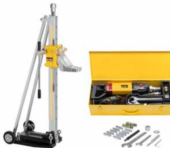
REMS Picus SR Set Titan