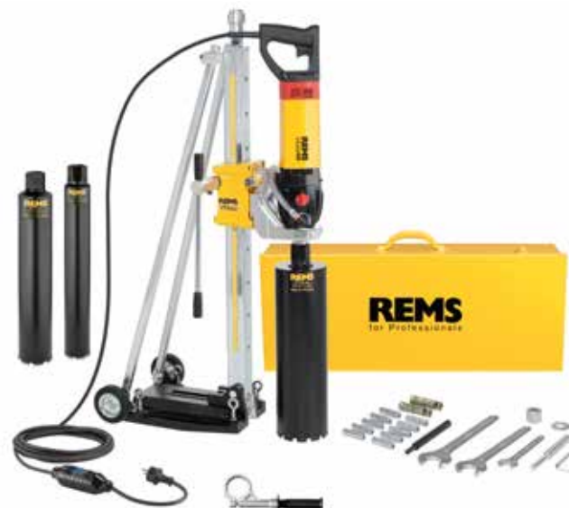
REMS Picus SR Set 62-82-132 Titan