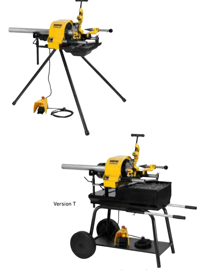
Wheel stand (accessory)

Robust, compact roll grooving attachment with oil hydraulic in-feed for pipe grooving of grooved coupling systems DN 25–300, 1-12" (page 48). Roll grooving with REMS Tornado up to DN 200, 8".