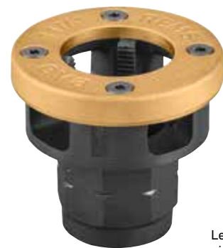
Left-hand pipe thread