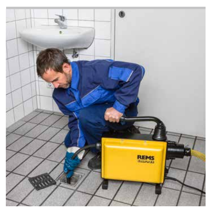
German Quality Product

Large variety of pipe and drain cleaning tools (page 288-289), also fit into pipe and drain cleaning machines of other makes.