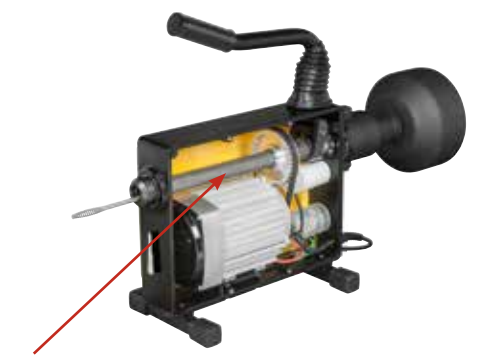
Straight through closed drive spindle protects motor and drive against dirt and water.