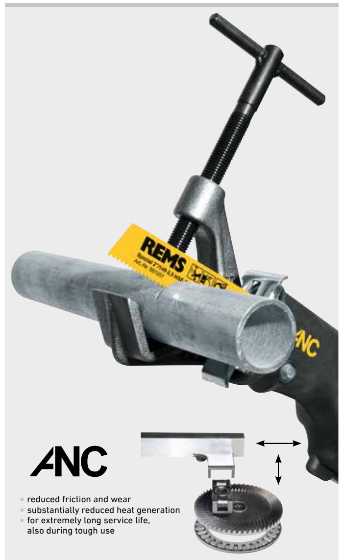
German Quality Product

Aggressive orbital action by vertical hacking motion of saw blade provides forceful, fast forward feed, excellent chip flow and long service life of saw blades. Fixed orbital action, running in needle bearings, ensures long-lasting and forceful