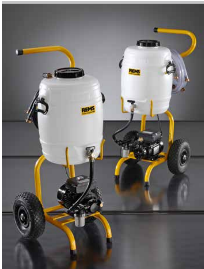
German Quality Product

Shut-off valve for closing the pressure or return line, e.g. during transport. Fine filter with fine filter bag 70 µm, consisting of a screw cap with return line connection for return line with ¾" union, adapter and fine filter bag 70 µm, or fine filter with fine filter cartridge 90 µm, washable, with large dirt collection vessel, for return line with ¾" connection for flushing underfloor heating/wall radiators and clearing sludge. Flow direction changeover valve complete with EPDM fabric hose ½" T100, for flushing underfloor heating/wall radiators and effective clearance of sludge by pressure surges when flow direction changes. Changeover valve for alternative suction of the transport medium from another tank, e.g. for larger volumes.