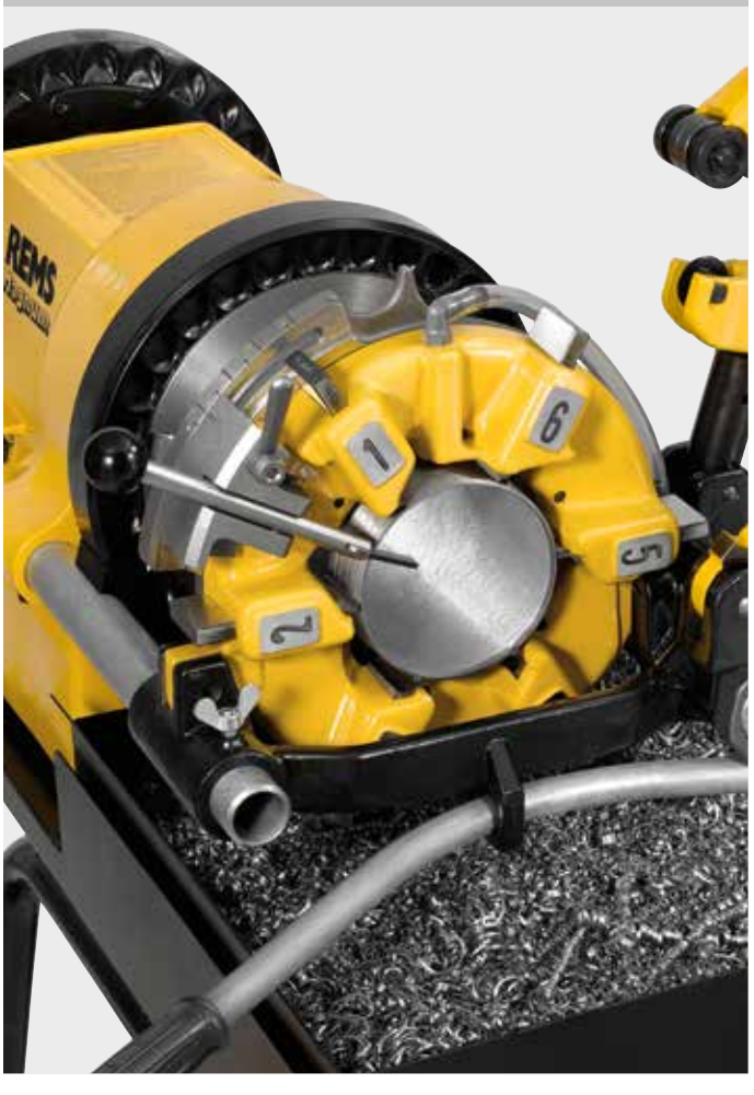
German Quality Product

For 2\frac{1}{2}-4 " and \frac{1}{2}-2 " one complete tool set each adapted to the work range with universal die head, pipe cutter, inner-pipe-deburring device, pressing lever, dies.