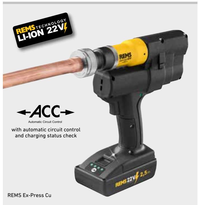
REMS Ex-Press Cu

High expanding force for perfect, split-second expanding. Thrust force 20 kN. Powerful electro-hydraulic drive with automatic return (ACC), with powerful battery motor 21.6V, 380W output, robust planetary gear, eccentric reciprocating pump and compact high power hydraulic system. Safety switch.