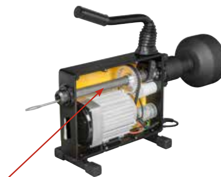
Straight through closed drive spindle protects motor and drive against dirt and water.