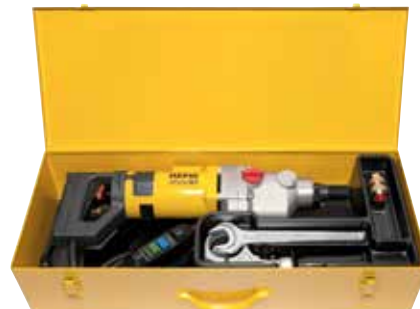
REMS Picus S3 Basic-Pack