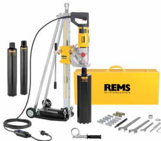
REMS Picus S3 Set 62-82-132 Titan