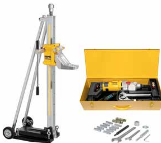
REMS Picus S3 Set Titan