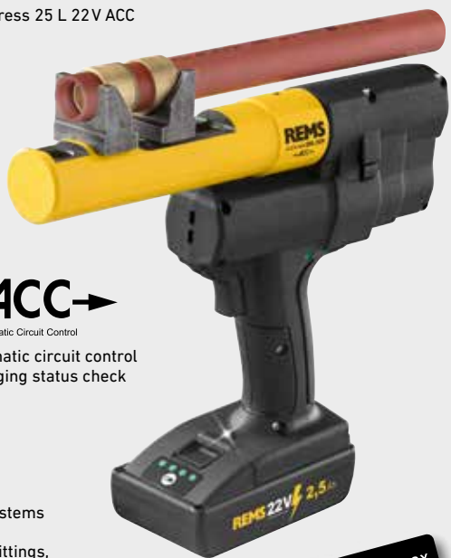
REMS Ax-Press 25 L 22V ACC