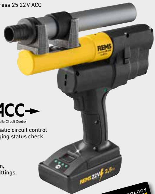
REMS Ax-Press 25 22V ACC

Various pipe expanders and complete range of REMS expanding heads for all common pressure sleeve systems