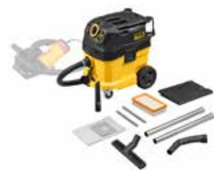
Extraction of health hazardous dusts when chasing and cutting: REMS Pull 2 M Set