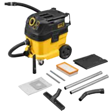
REMS Pull 2 M Set