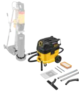
Extraction of drilling sludge when wet drilling with REMS drill stands: REMS Pull 2 L Set W

PES flat folded filter required for extraction of water. Use wet filter bag or polythene bag if necessary. Wet filter bags separate the water from the sucked up solids when extracting dirty water. Polythene bags simplify disposal of the dirt and prevent dirt from collecting in the tank.