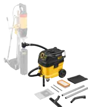
Extraction of health hazardous dusts when dry drilling: REMS Pull 2 M Set D