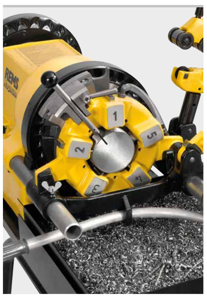
German Quality Product

For 2\frac{1}{2} - 3 " and \frac{1}{2} - 2 " one complete tool set each adapted to the work range with universal die head, pipe cutter, inner-pipe-deburring device, pressing lever, dies.