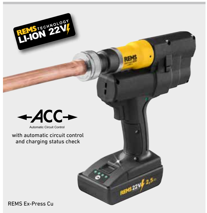
REMS Ex-Press Cu

High expanding force for perfect, split-second expanding. Thrust force 20 kN. Powerful electro-hydraulic drive with automatic return (ACC), with powerful battery motor 21.6V, 380W output, robust planetary gear, eccentric reciprocating pump and compact high power hydraulic system. Safety switch.