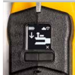
Electrically monitored closing position of the tong retaining bolt.