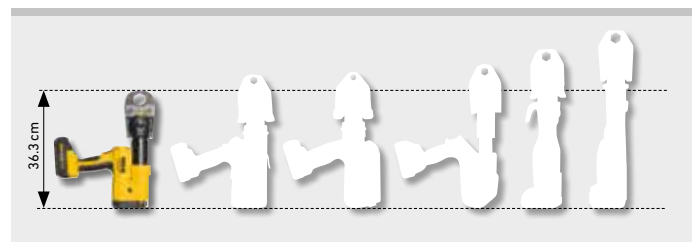
The little one amongst the big. Only 3.3 kg.

Li-Ion 22V Technology. Highly resistant Li-Ion 21.6V battery with 2.5, 4.4, 5.0 or 9.0Ah capacity, for long service life. Light and powerful. Li-Ion 21.6V, 2.5Ah batteries for approx. 210 pressings, 4.4 Ah for approx. 370 pressings, 5.0Ah for approx. 420 pressings, 9.0Ah for approx. 750 pressings Viega Profipress DN 15 with one battery charge*. Graduated charging status check by coloured LEDs. Operating temperature range - 10 to + 60 °C. No memory effect for maximum battery power. Rapid charger 100-240V, 90W. Rapid charger 100-240V, 290W, for shorter charging times, as accessory. Voltage supply 220-240V/21.6V, 15A output, for mains operation instead of Li-Ion battery 21.6 V, as accessory.