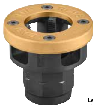
Left-hand pipe thread