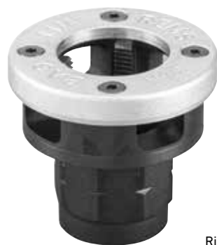
Right-hand pipe thread