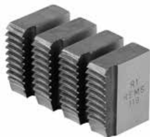
German Quality Product