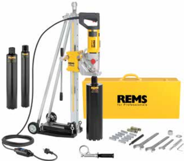
REMS Picus S3 Set 62-82-132 Titan