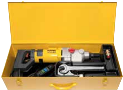
REMS Picus S3 Basic-Pack