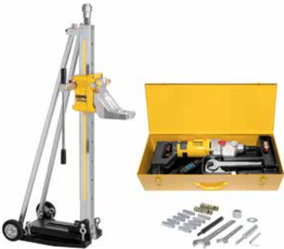
REMS Picus S3 Set Titan

REMS Picus S3 Basic-Pack. Electric diamond core drilling machine for core drilling in concrete, steel-reinforced concrete ≤ Ø 152 (200) mm, masonry and other materials ≤ Ø 250 mm. For dry and wet drilling, hand held or with drill stand. Drive machine with drilling crown connecting thread UNC 1 ¼ male, BSPP ½ female, maintenance-free 3-speed gear with safety slip clutch, universal motor 230 V, 50–60 Hz, 2200 W. Multifunction electronics with soft starting, idle speed limiting, overload protection, blocking protection. Touch switch with lock, personal protection switch (PRCD). Load speed drilling spindle 530 rpm, 1280 rpm, 1780 rpm. Water supply with adjustable shut-off valve and quick-coupling with water stop and hose connection ½". Stabiliser. Starting aid BSPP ½, Allen key size 3. Single open-ended wrench size 32. In sturdy steel case.