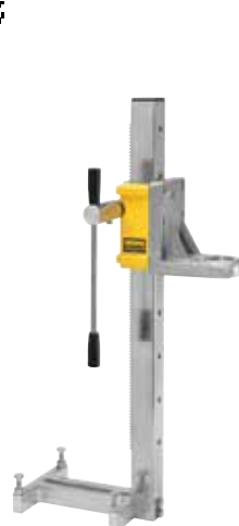
REMS Simplex 2