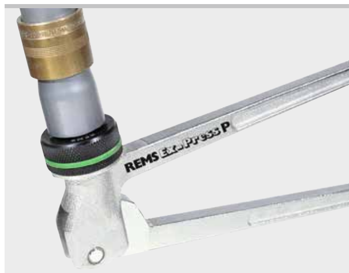
German Quality Product