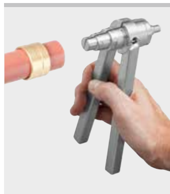
German Quality Product