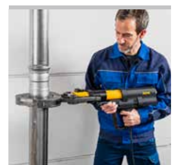
German Quality Product