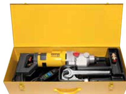
REMS Picus S3 Basic-Pack