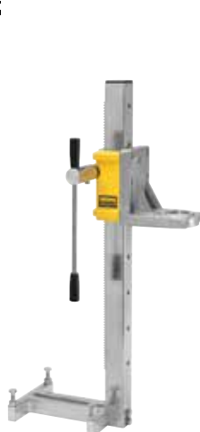
REMS Simplex 2