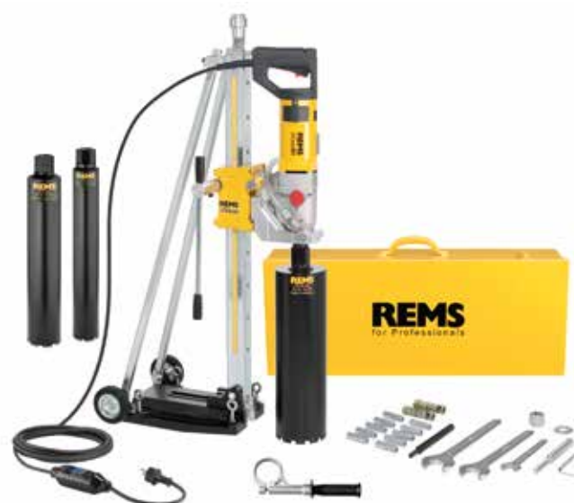
REMS Picus S3 Set 62-82-132 Titan