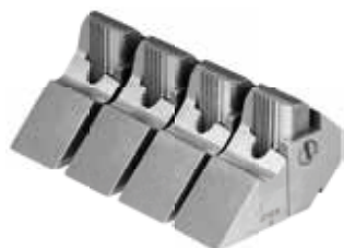
German Quality Product