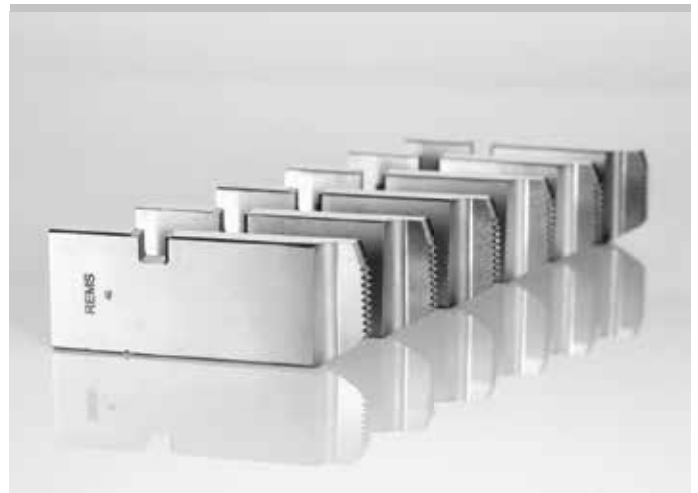
German Quality Product